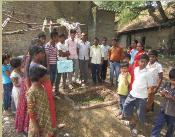
Hygiene and sanitation and de-composting waste training.

youth and taught them different aspect of hygiene and sanitation like personal hygiene, food hygiene, water safety, disposal of human and animal waste and environmental sanitization etc.