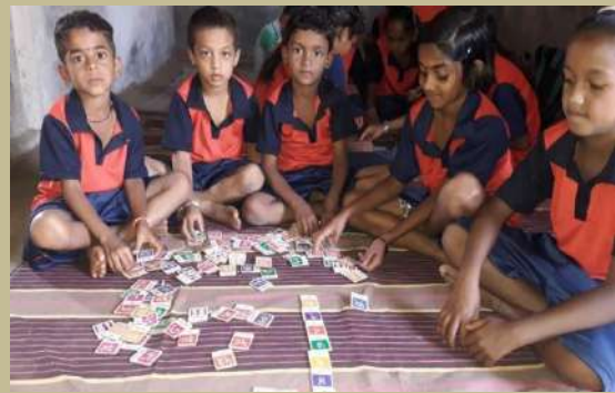
Children upgrading their different skills in the CLCs.