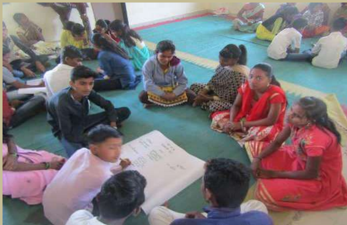
Youth meetings/learning skills.