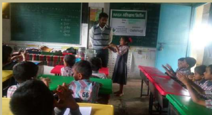
Personal Hygiene sessions in the Primary school.