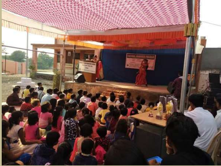
Cultural program organized by Youth.