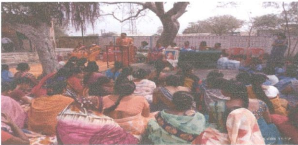
Self-Help Group formation at Kauthe-Kamaleshwar