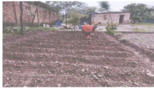
After Kitchen garden development