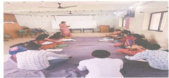
NISD Staff trainings and staff monthly meeting at Project level