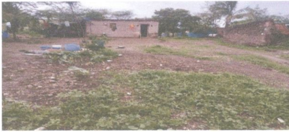
Before Kitchen garden