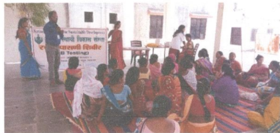
View of HB Testing camps at village level.