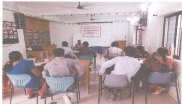
Training Given by Goat Trust of India to the NISD program staff