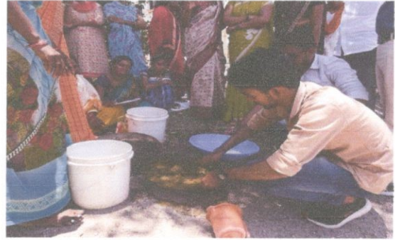
Nutrition Garden training for NISD staff Organic Pesticide training at Village level