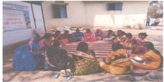
SHG meeting at Tigaon village