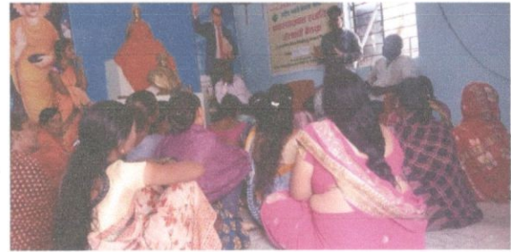
Village leader/ Gram panchayat member's meetings