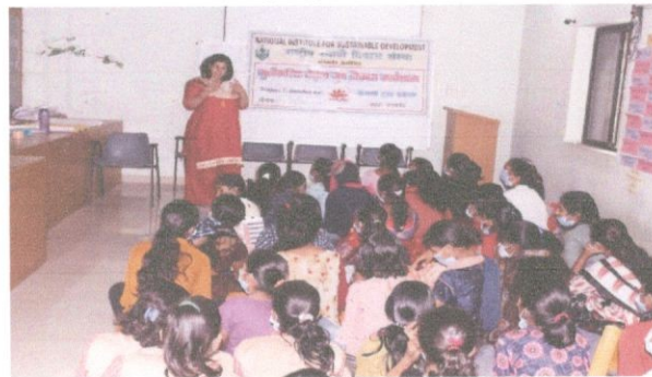
Leadership training for girls group leaders.