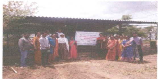
Nutrition Garden demonstration training for NISD staff at field level