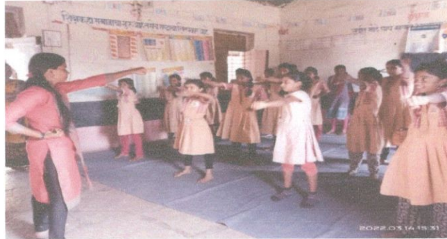
A view of Self- Defense Training for adolescent girls.